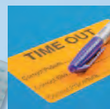
Marker and Time Out Label