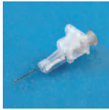
BD SafetyGlide™ Needle