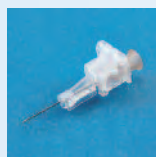
BD SafetyGlide™ Needle