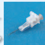
BD SafetyGlide™ Needle