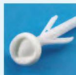
ChloraPrep® Applicator Hi-Lite Orange™