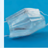
Ear Loop Mask

Cat. No. 979 Arthrogram Tray Pkg. 10 per case