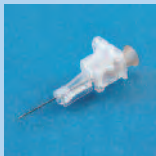
BD SafetyGlide™ Needle