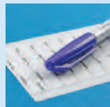
Marker and Medication Labels