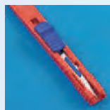
#11 safety scalpel

Basic Soft Tissue Biopsy Tray Pkg. 10 per case