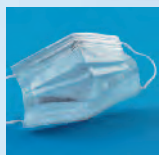
Ear Loop Mask